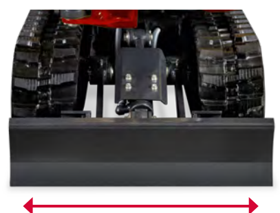
Retracted undercarriage 680 mm - Best manoeuvrability