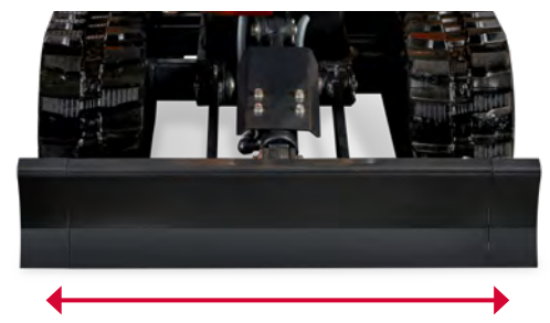
Extended undercarriage 840 mm - Increased stability

The hinged blade extensions are permanently fixed to the blade. No tools are necessary to quickly change the width of the blade. No risk to lose the blade extensions.